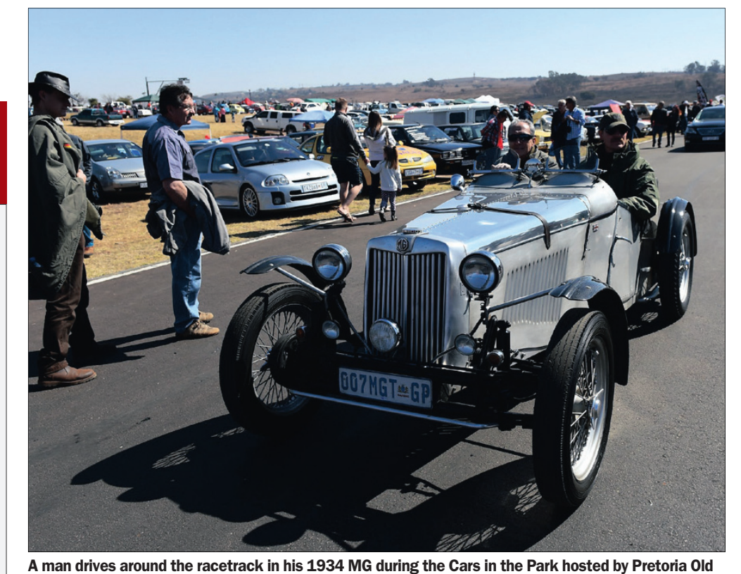
Motor Cars at Zwartkops Racecourse.

Old Motor Club is however to bring together people who own one or more of the above to share their enthusiasm with each other, irrespective of how collectable or expensive a vehicle might be.