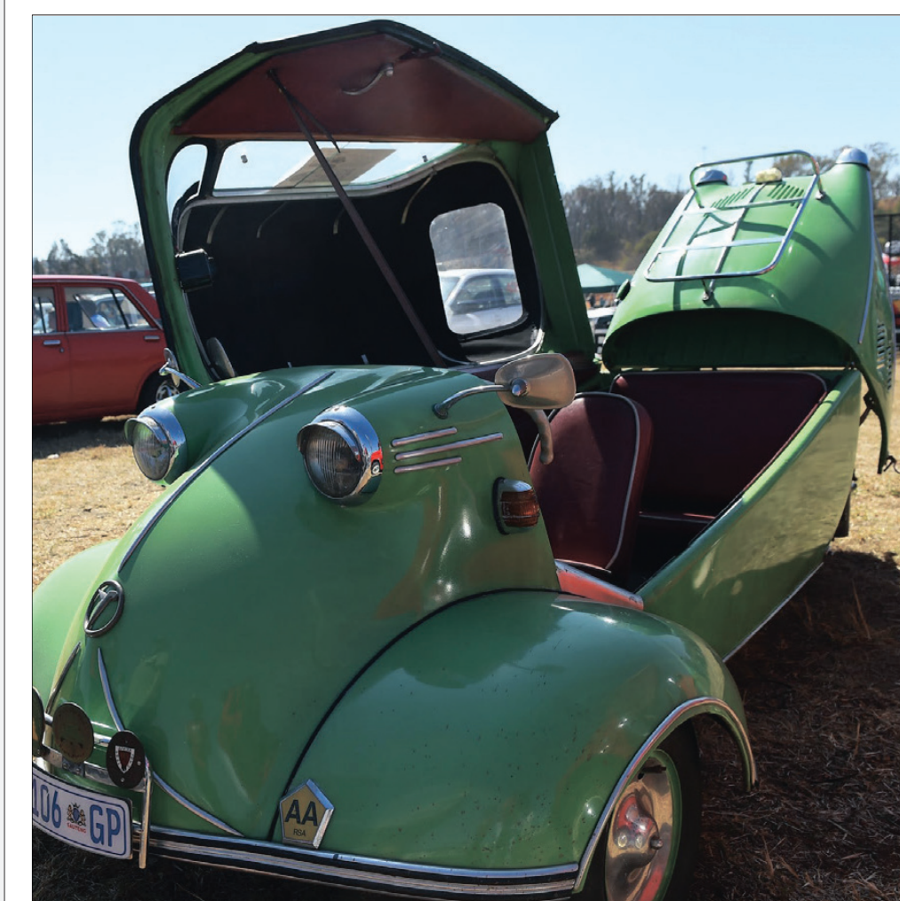
A Messerschmitt was one of the attractions during the the recent Cars in the Park event hosted by Pretoria Old Motor Cars at Zwartkops Racecourse